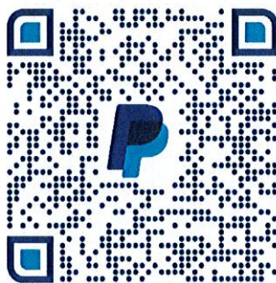
Pay with PayPal