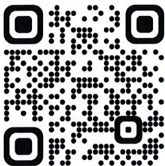
Online membership form

To become a member online, use the QR codes below. Please complete the online form, and purchase your membership using either PayPal or Venmo. To pay by check, complete and return the paper form below.