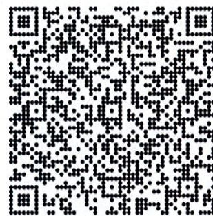
Pay with Venmo